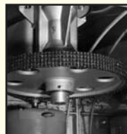
BIRO exclusive non-slip chain drive transmission.

THE BIRO MANUFACTURING COMPANY 1114 WEST MAIN STREET MARBLEHEAD, OH 43440-2099 U.S.A. Phone: (419) 798-4451 Fax: (419) 798-9106 http://www.birosaw.com sales@birosaw.com