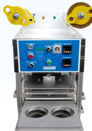
VT-109 Cup Sealer