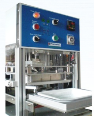
VT-109 Tray Sealer