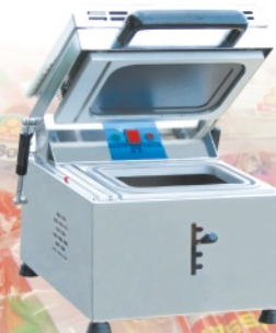
VT-106 Tray Sealer

All specifications are subject to change without notice.