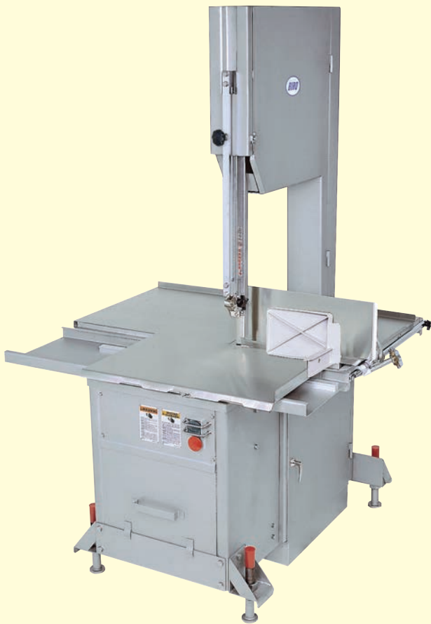
STANDARD RIGHT TO LEFT FEED CONFIGURATION (FRONT MOVING CARRIAGE AND STATIONARY REAR TABLE)

The 5 HP (3 Kw) motor provides all the power you need to break pork, lamb, veal, or beef all day in a high volume production operation. Heavy duty, stainless steel construction helps the Model 55 hold up under the harshest conditions with minimum maintenance. With the standard front moving carriage and meat gauge plate and 20" H (508mm) by 21" D (533mm) cutting clearance, you can use the same saw to produce retail cuts or split loins and break quarters, which makes the Model 55 unmatched for versatility. Superior BIRO engineering means you'll have a saw that's built to last. Over the life of the saw, you'll get more for your money. As with all BIRO products, if you need a particular modification to fit your application let us know. We'll try to build it for you - something only BIRO does.