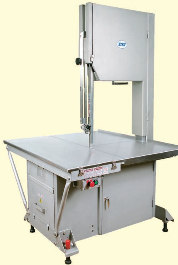
RIGHT TO LEFT FEED CONFIGURATION (STATIONARY REAR TABLE- OPTIONAL FRONT STATIONARY TABLE)