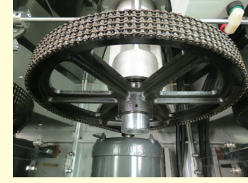
Biro exclusive non-slip chain drive transmission.

BIRO MANUFACTURING COMPANY 1114 WEST MAIN STREET