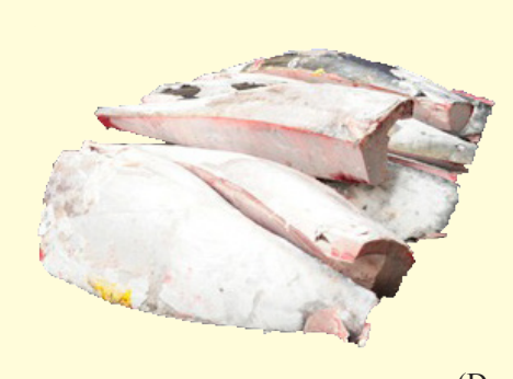
(Design C) Model 44SSFH-LP-HDFFT Stainless Steel, Fixed Head, Low Profile, High Speed Saw, with Heavy Duty Front Fixed Table Breaking/Trimming