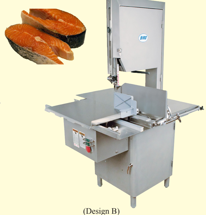
Model 44SSFH-LP-FS-R Stainless Steel, Fixed Head, Low Profile, High Speed Saw, Fish Steaking/Retailing