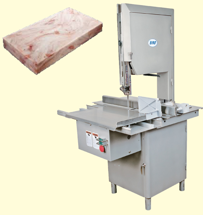
(Design A) Model 44SSFH-LP-PGF Stainless Steel, Fixed Head, Low Profile, High Speed Saw, with Precision Gauge Fence for Frozen Fish Block Portion Control Fish Products