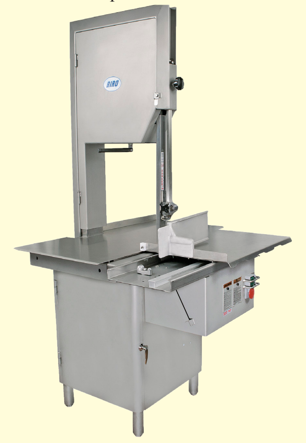
Model 44SSFHTL (Stainless Steel Fixed Head True Left)

The BIRO Model 44SSFH (Stainless Steel/Fixed Head) Power Meat Saw equipped with a 142" (3606.8 mm) Saw Blade is a heavy-duty, high-volume bandsaw that is well-suited for continuous intensive operation. The 3HP industrial motor, at 4000 feet per minute as standard blade speed, provides you with plenty of power and efficiency. BIRO's unique EZ-Flow meat carriage with 8 Stainless Steel Bearings helps reduce operator fatigue and increase productivity. The watertight magnetic electrical controller helps ensure safe, reliable operation. The 18" (457mm) diameter saw blade wheels with a 17-5/32" (435.8mm) horizontal cutting clearance and a full 17-1/8" (435mm) vertical cutting clearance (excluding Low-Profile, High Head, and some tabling) lets you cut larger product pieces than other saws. A broad range of designs, configurations, and options give you the flexibility to own a saw that fits your exact needs. The BIRO Model 44SSFH Series Power Meat Saws have superior durability and engineering features you've come to expect from BIRO, which means you'll get years of reliable use, low maintenance, and minimal overall cost of ownership.