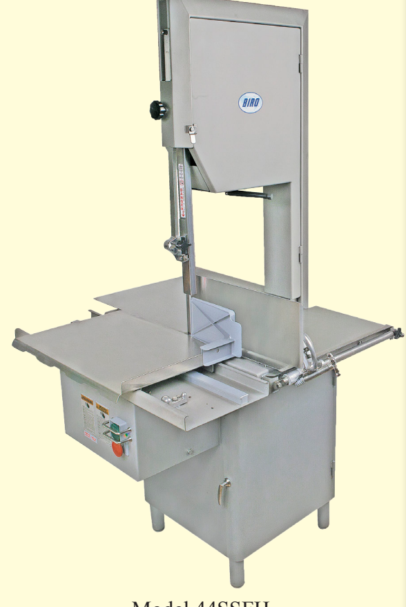
Model 44SSFH (Stainless Steel Fixed Head)